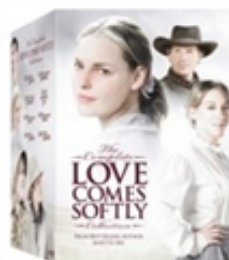
Love Comes Softly Collection - All 8 complete full-length movies of the beloved series