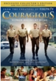
A powerful story about five men who are challenged to become Godly fathers encouraged and challenged millions of moviegoers, and now you can enjoy it at home.

Here are just a few of the many family-friendly movies available right now in the AFA Online Store :