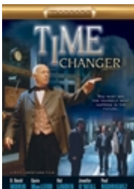
A Bible professor from 1890 suddenly finds himself in a present day